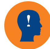
Suicides in Maine, by Gender

In 2017, there were 274 deaths where suicide was a primary reason. 7 This was a 20% increase since 2016 (226). Males accounted for about 80% of suicides. 7